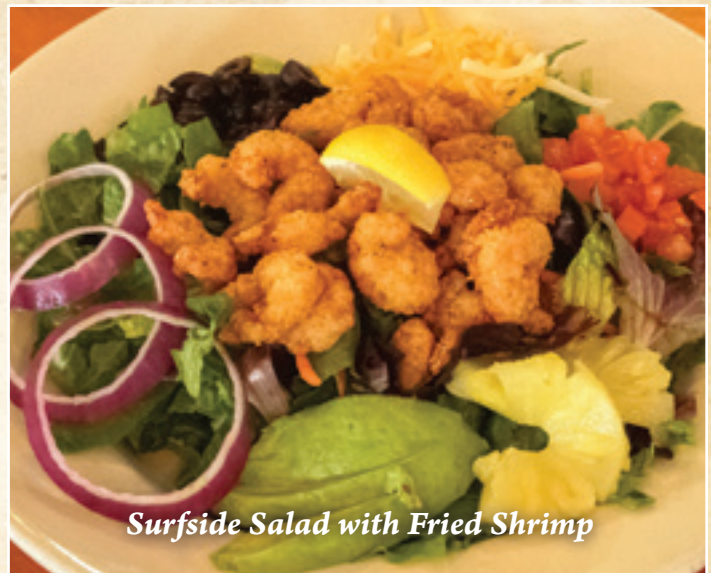
Surfside Salad with Fried Shrimp